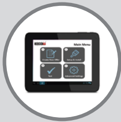
Easy Access Ordering Platform