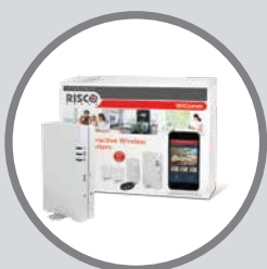
Self Installation at Professional Level, cost effective automatic cloud based configuration Kit

A user-friendly smartphone app is included for full control of security and home safety accessories, along with a variety of expansion options that can transform the customer's security system into a scalable smart home system.