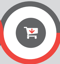
Online Direct Selling Platform