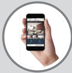
One App For Security, Video and Connected Home