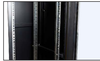
empty RACK 19" cabinet