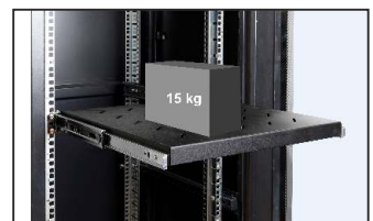
shelf loading capacity