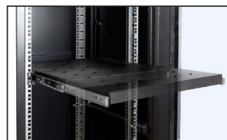
Full-extension slide of the shelf