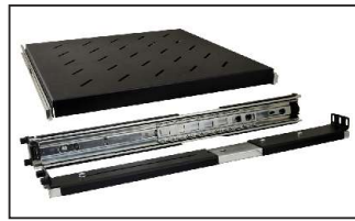
shelf with guides